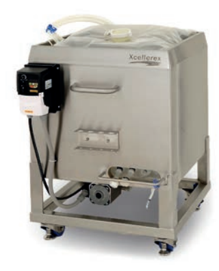
Fig 3. XDM Quad Mixing System, with a powerful motor and magnetically locked impeller, effectively mixes even highly viscous materials.

Our RRP program manufactures up to 200 L of your custom prototype formulation within seven working days of your request. Use our RRP service to expedite the development and testing of custom media for your biopharmaceutical manufacturing process.