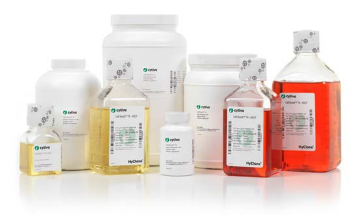
Fig 1. ActiPro, ActiSM, and Cell Boost 7a and 7b are designed for high yields of recombinant proteins in fed-batch culture processes with CHO cells.

The supplements should be added to the cultivation vessel as individual solutions and should not be mixed in advance as this will cause precipitation. The recommended ratio of Cell Boost 7a to 7b is 10 to 1 (v/v) (example feeding strategy Cell Boost 7a at 3% and Cell Boost 7b at 0.3%). The total amount of feed added and the specific feeding regime will need to be adjusted according to the nutritional requirements of each specific clone. The supplements are available as a powder or in a ready-to-use liquid format for research and process development. The liquid feed supplements meet testing specifications and are stable up to 12 months in PETE bottles and 9 months in bioprocessing bags at 2°C to 8°C (Fig 2).